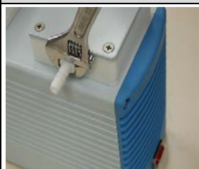
Chemker 410, setup (glass) vapor trap / vacuum regulator

Remove the Teflon tier connector at side of cylinder head with a spanner.