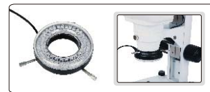
LED ring light(optional)