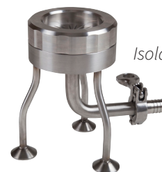
Isolator Monitoring Kit