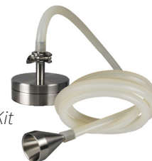
Remote ISP Sampling Kit