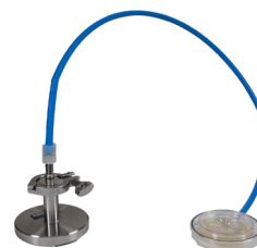
Remote connection to BioCapt® Single-Use

BioCapt® and MiniCapt® are registered trademarks of Particle Measuring Systems. All other trademarks are the property of their respective owners. Particle Measuring Systems, Inc. reserves the right to change specifications without notice.