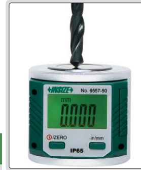
automatic backlight at zero