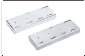
5mm and 10mm standard indentation blocks(included)