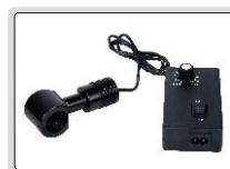
coaxial illumination (included)