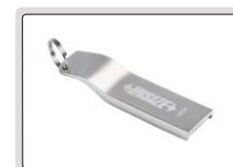
16G USB flash disk (included)