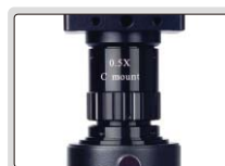
0.5X camera adapter (included)