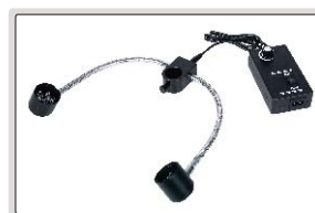
LED auxiliary illumination (optional)