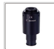
1X camera adapter (optional)