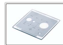
calibration plate (included)