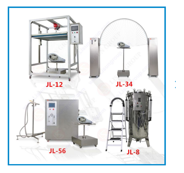
JL-X Waterproof Test