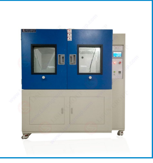
SC-015 Dustproof Testing Machine