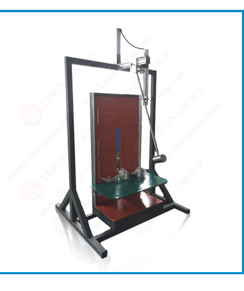
IK07-10 IK Level Tester