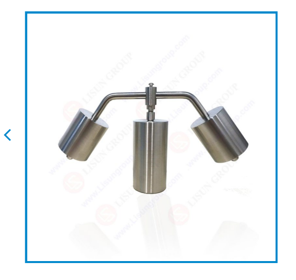
ZBP-T Ball Pressure Test Device

It is with Protection against electric shock device. The SMT-1 standard test finger is according to IEC60335, IEC60884, IEC61032, IEC60529, IEC60065, IEC60035, IEC60950, EN60529, EN60950, GB4706, GB7000, GB-16916.1, GB9706, UL507, VDE0470, etc.