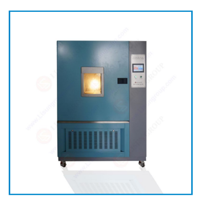
GDJS-015B High and Low Temperature Humidity Chamber