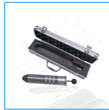
IK01-06 Spring Impact Hammer IK Level Tester