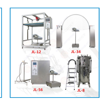
JL-X Waterproof Test