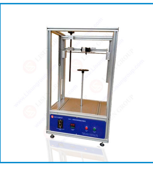
WDT-1 Wire Damaged Tester