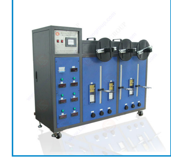
SW-6 Power Cord Bending Tester