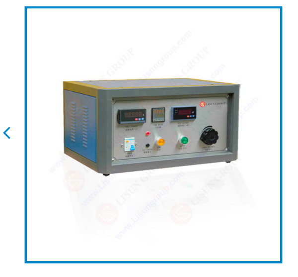
JCY-1 Contact Pressure Drop Test Device