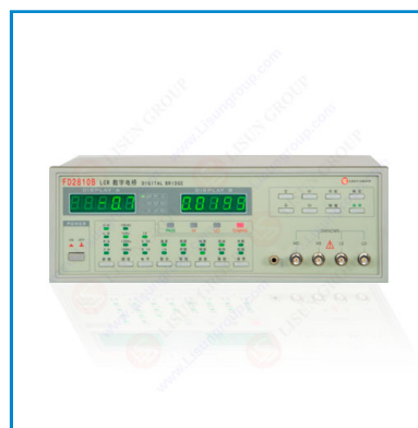
FD2810B LCR Digital Bridge