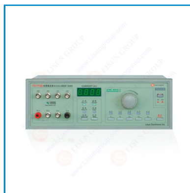
FD1772B DC Bias Current Source