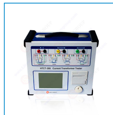
HTCT-300 Current Transformer Tester