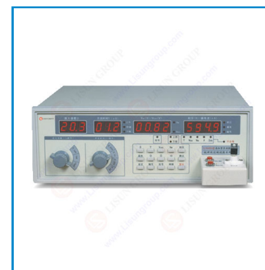
UI9600A Transistor's Multi-Functional Selector