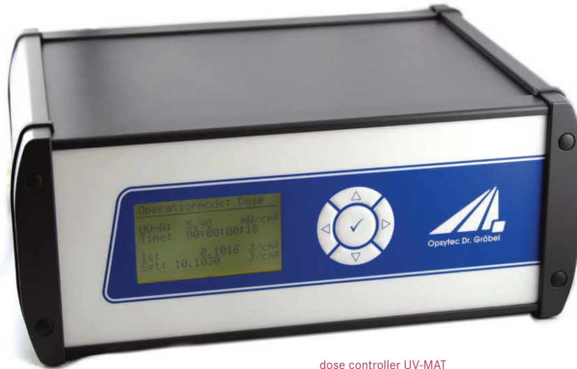
dose controller UV-MAT

The dose controller UV-MAT continuously measures irradiances, calculates doses, and stops irradiation at the set target dose. Two spectral ranges can be separately controlled. Thus, UV-MAT ensures a constant dose independent from lamp aging, temperature, and pollution.