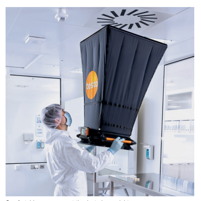
Comfortable measurement thanks to low weight