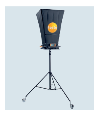
Stable, wheeled tripod with central fitting for secure working at high ceiling outlets.