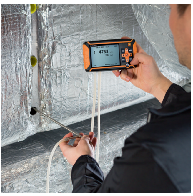
Removable instrument allows Pitot tube measurements in ducts (Pitot tube available separately)