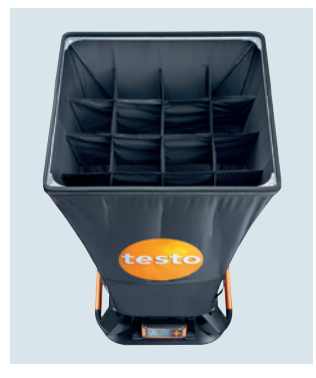
Flow straightener for significantly more precise measurements at swirl outlets.