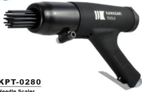
KPT-0280 Needle Scaler