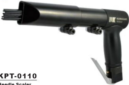
KPT-0110 Needle Scaler