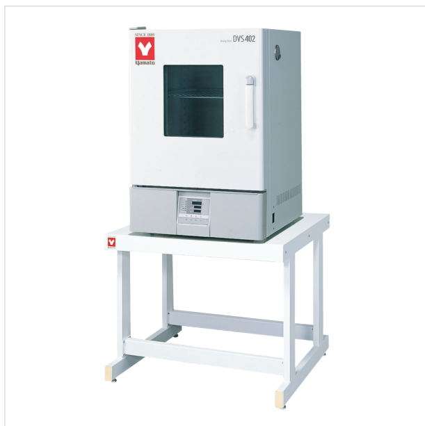
DVS402、DVS602、Stand is option