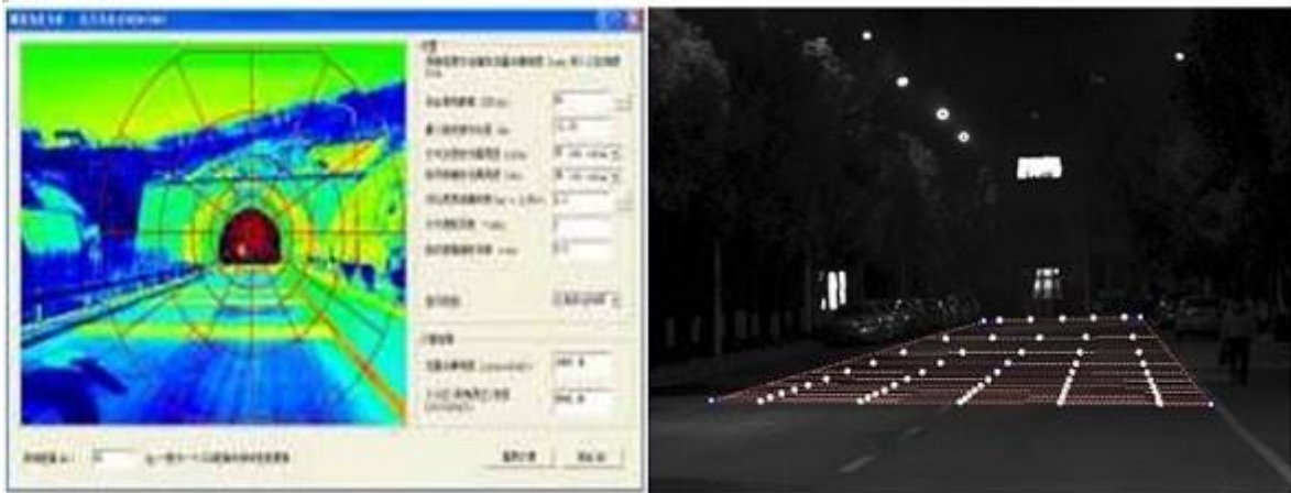
Fully meets CIE 88-2004 "Guidelines for Lighting Design of Tunnels and Underpasses" and GB/T5700 "Lighting Measurement Methods" and other standards.