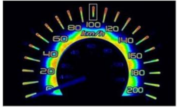
The measurement result of black and white uniformity