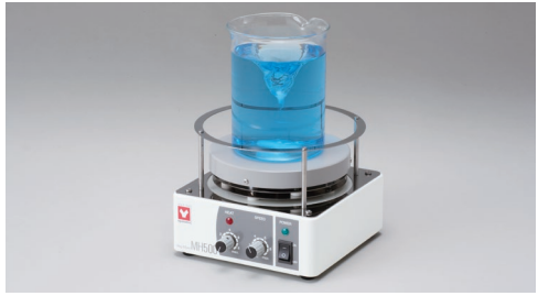
MH520+Tipping preventor (optional)