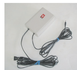
⑥ Remote control power supply