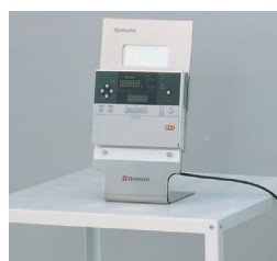
⑤ Remote control panel stand