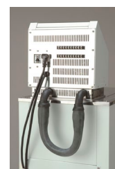
Circulation port For externally closed circulation an insulated hose is used.