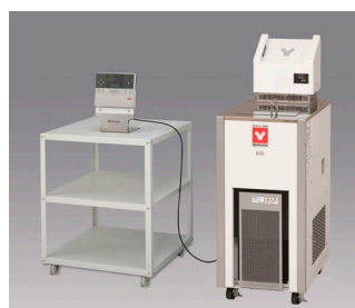
The control panel can be detached from the main unit to perform remote control.

* Room temp. : 20°C, Load : No load, Power supply : AC100V 50Hz Amount of liquid: 20L, Heating (tap water) Cooling (ethanol 50%)