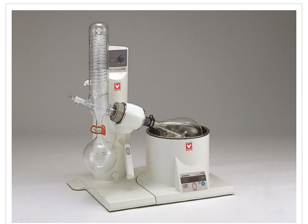
The photo shows RE 301 B - W (main body + glass set B + water bath BM 500 type)