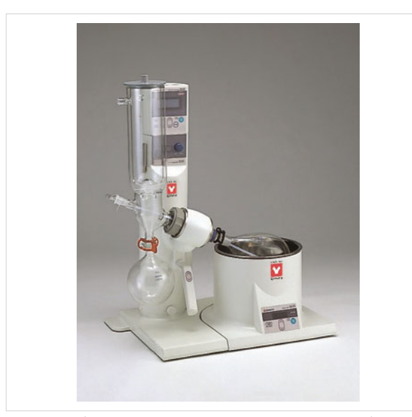
RE 601 C - W (main body + glass set C + water bath BM 500 type)