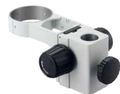
SZA1 focus holder