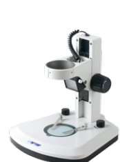
BL1 arm stand base with fixed focus holder and LED illumination