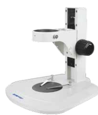
B6 big plan base with arm stand and fixed focus holder