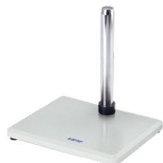
B5 big plan base with pillar stand