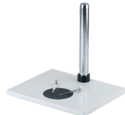
SZST2 big plan base with pillar stand