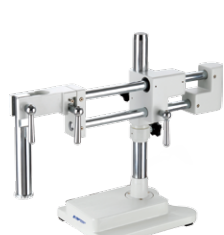
SZSTL2 double pillar boom stand