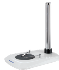
B4 small plan base with pillar stand