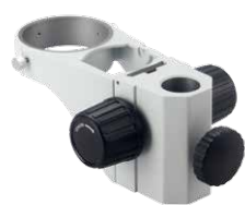
ST70A1 focus holder