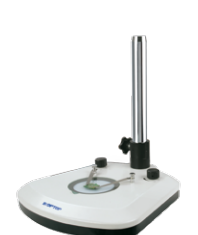
BL3 pillar stand base with LED illumination