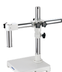
SZSTL1 single pillar boom stand