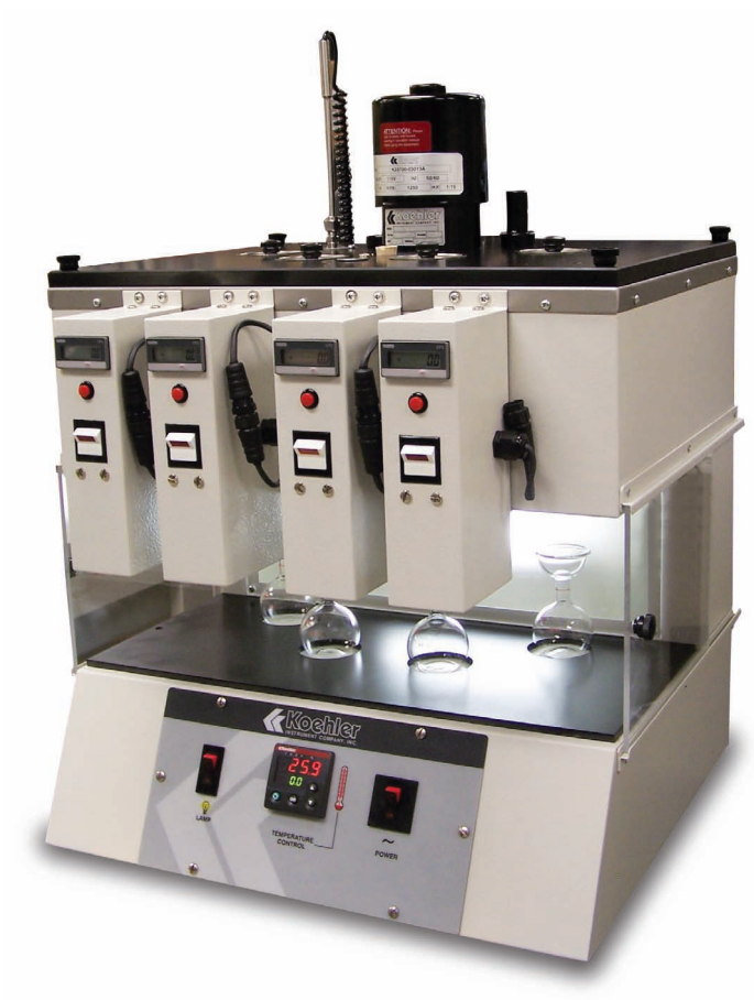
K21414 Saybolt Viscosity Bath (SV4000) with K21404 Auto Viscosity Timers