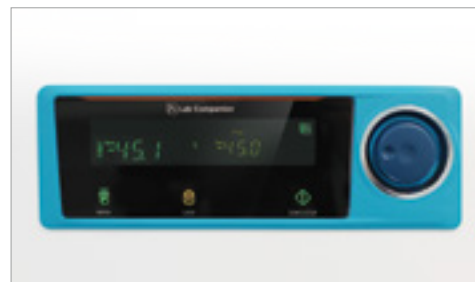
Intuitive checking of device operation information with large VFD