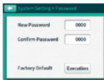
Digital door lock (CLG3 model)