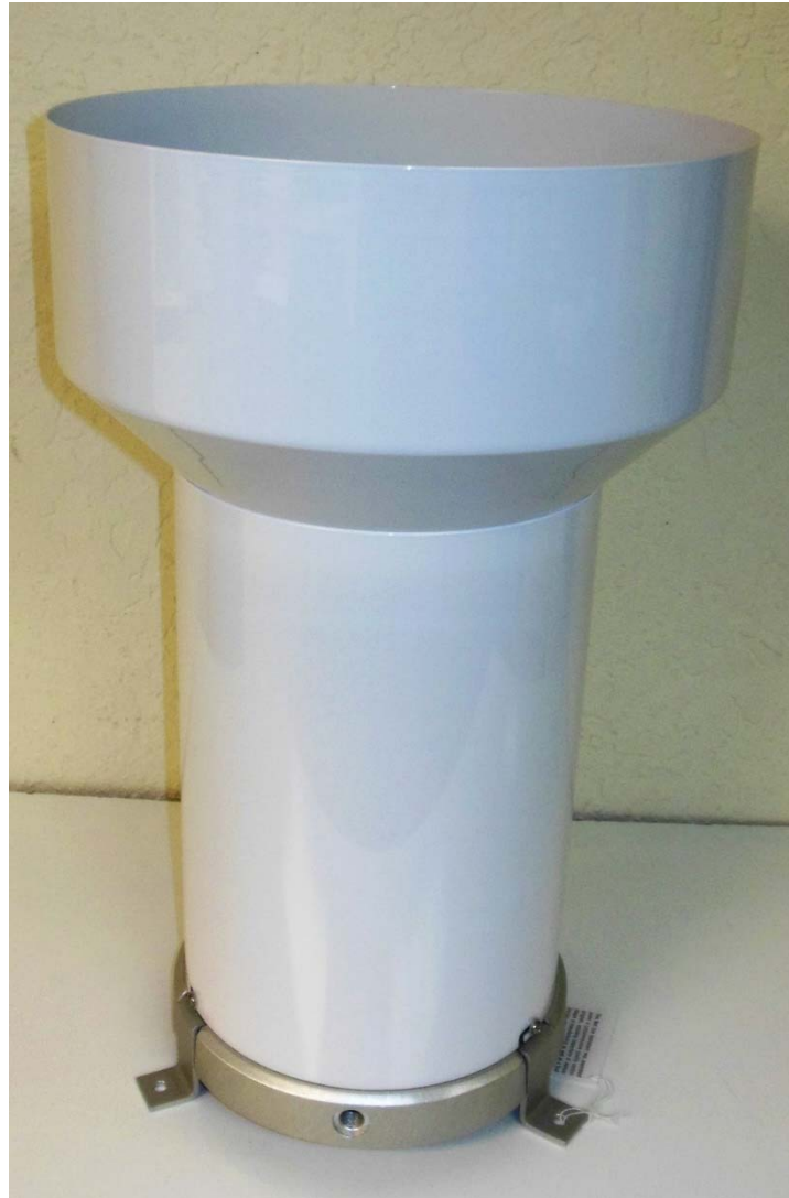
Figure 1-1 380D

The Model 380D and 382D Tipping Bucket Rain Gauges are virtually the same. The primary difference between them is that the 380D can have multiple calibration rates whereas the 382D is calibrated specifically for 0.1 mm of rainfall per tip. For simplicity, the rest of this manual will only reference model number 380D, except where notable differences occur.