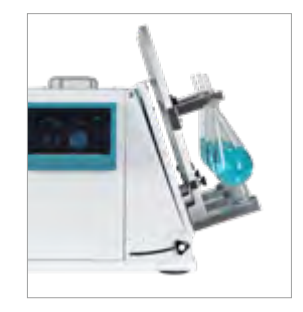
Tilt angle adjustment from 0 to 20° for maximum mixing efficiency.