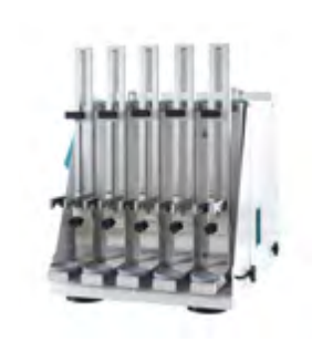
Up to 5 holders may be installed on each side.