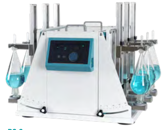
RS-2 with Hoders 4ea (standard), Hoders 2ea (option)