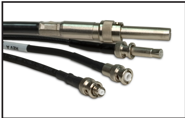
High voltage cables

The PS300 Series High Voltage Power Supplies are as useful in the R&D lab as they are in automated test applications. Wherever you are using them, the PS300 Series provide proven reliability and performance at a very affordable price.