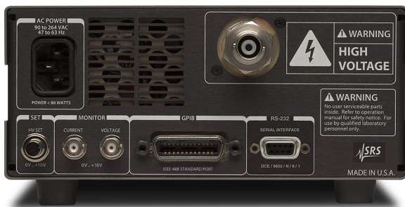
PS370 rear panel

Both GPIB and RS-232 computer interfaces are standard on all 10 W supplies. GPIB is available as an option on the 25 W instruments. All parameters can be set and read via the computer interfaces.