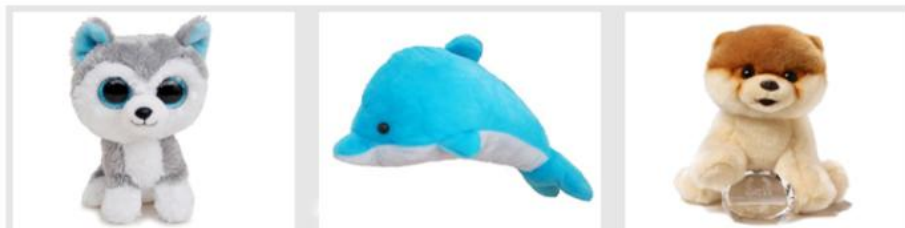
Eyes of Soft-filled toys

Many kinds of toys can be tested on Bench Vice.